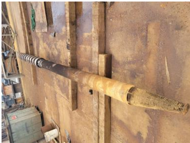
Pump-Suction and Cone Strainer on Wash Pad