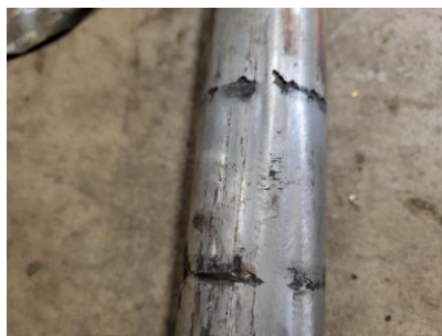
Bowl Shaft Pitting