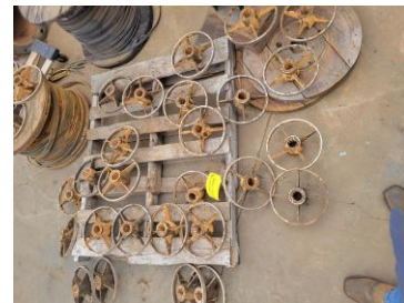
Retainers with old bearings