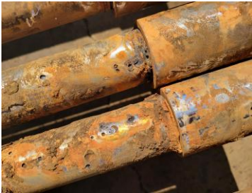
Rusted and Pitted Line Shaft