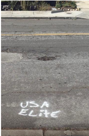
Sinkhole when Initially Reported