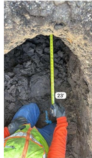
Length of Cavity