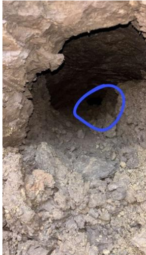
Looking Down into Cavity