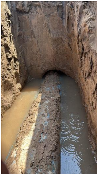
Groundwater in Sinkhole