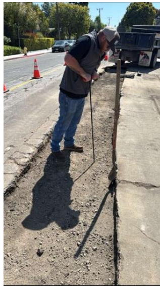
Trench Backfilled and Compacted